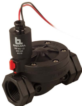
External pilot control