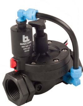
Upstream pilot control