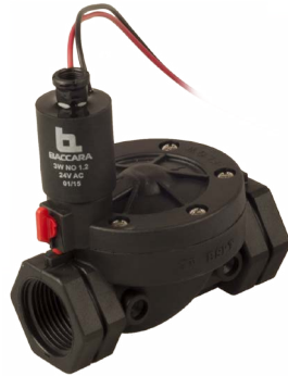
External pilot control